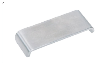
316 stainless steel standard block(included)