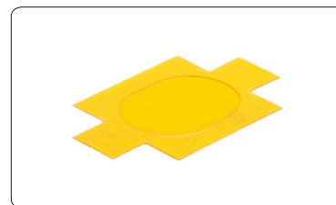
window protection film(included)